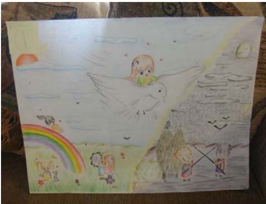
1 st Place Peace Poster Winner