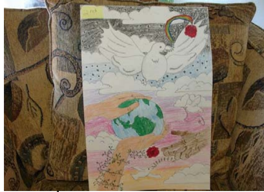
2 nd Place Peace Poster Winner